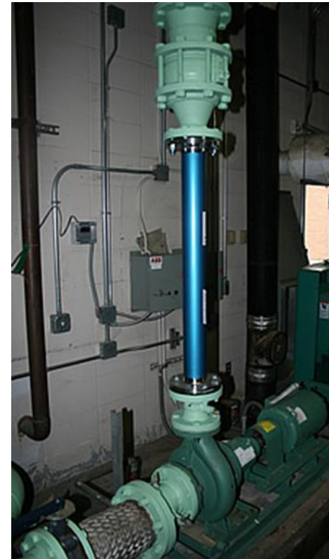
Walker Station, Fort Bend ISD, TX